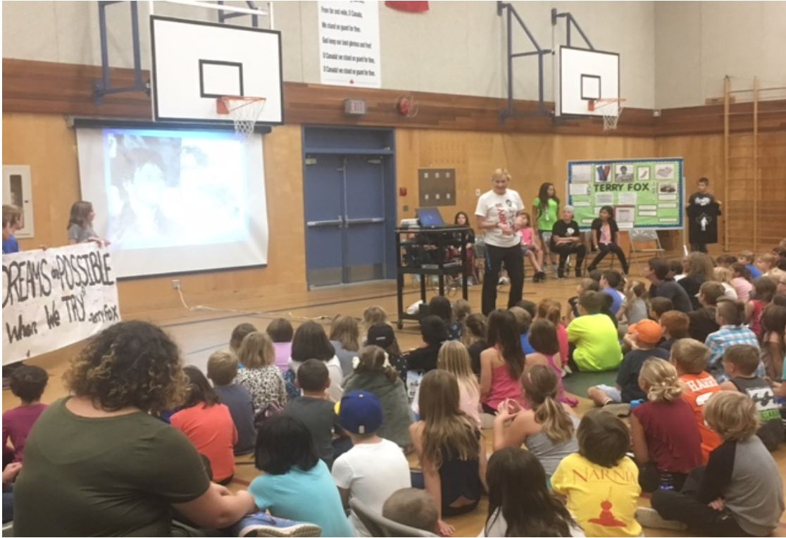
Our GOAL is to raise $500. We are currently at $402.50. Reminder, we are still collecting donations at the office.