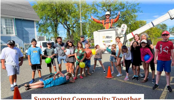
Supporting Community Together