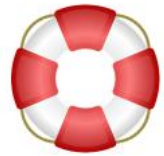
FIRST MATE MARTENS