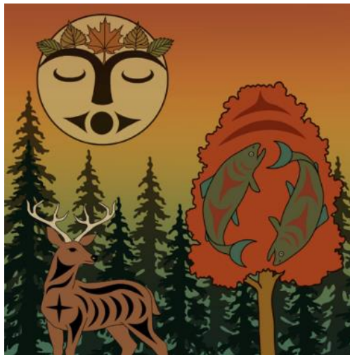
Artist: Ocean Hyland Qualicum First Nations

Despite the weather, our students continue to explore and play outdoors during recess and lunch breaks. We suggest students keep a spare change of clothing at school for unexpected situations. While we maintain a limited supply of spare clothing, having personal backups ensures that your child remains comfortable and ready for any weather-related surprises.