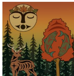
Artist: Ocean Hyland Qualicum First Nations

Despite the weather, our students continue to explore and play outdoors during recess and lunch breaks. We suggest students keep a spare change of clothing at school for unexpected situations. While we maintain a limited supply of spare clothing, having personal backups ensures that your child remains comfortable and ready for any weather-related surprises.