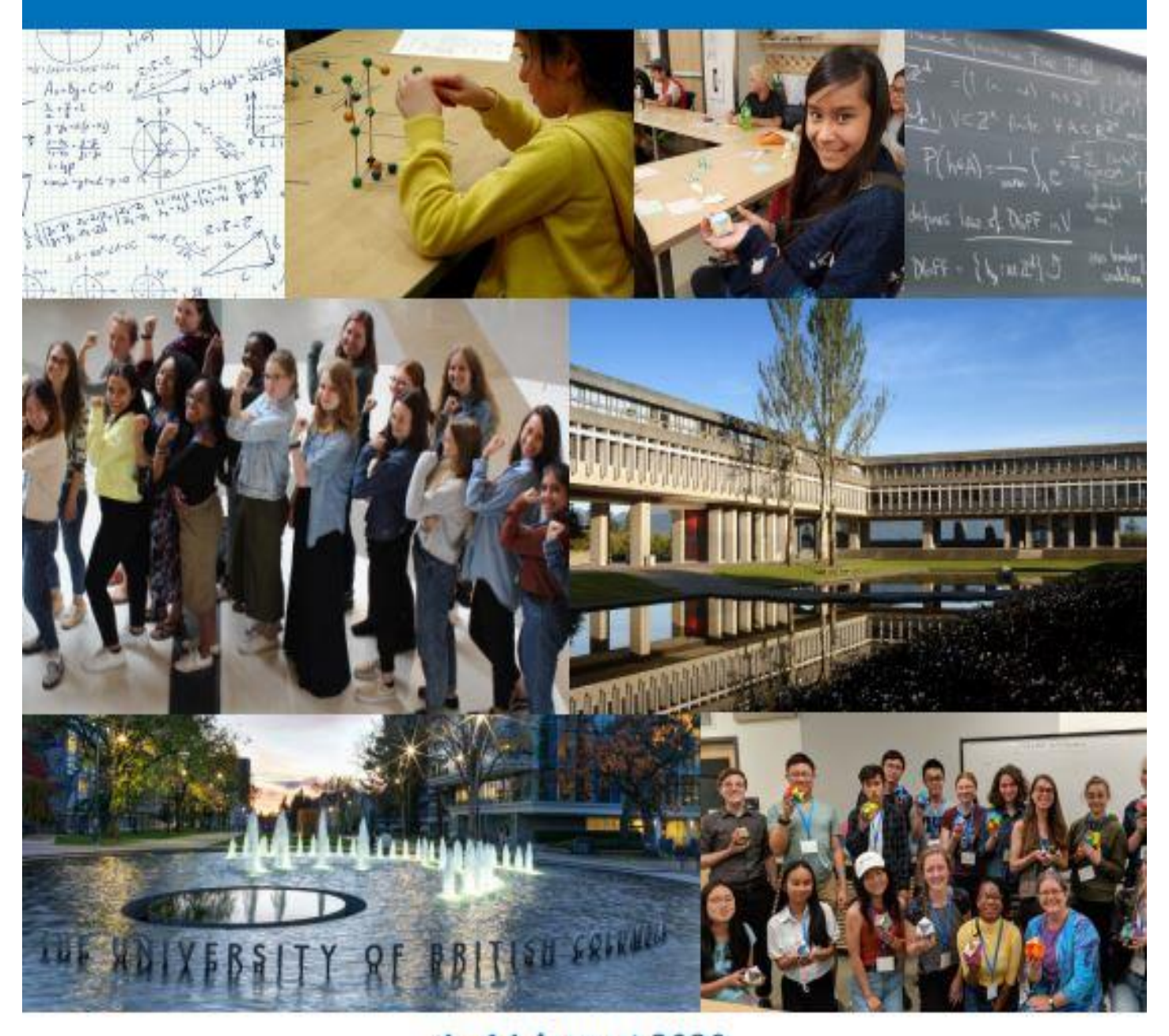
4 - 14 August 2020 ONLINE