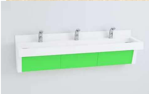
SOLID SURFACE TROUGH SINK