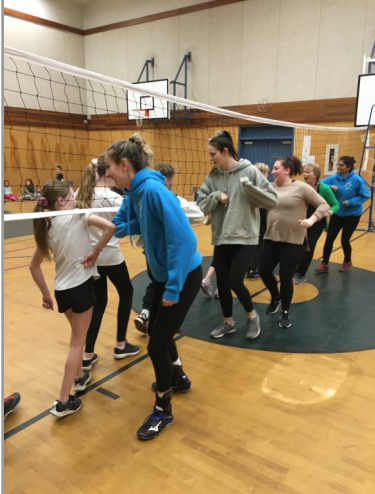
Staff vs students volleyball game. Go Eagles!