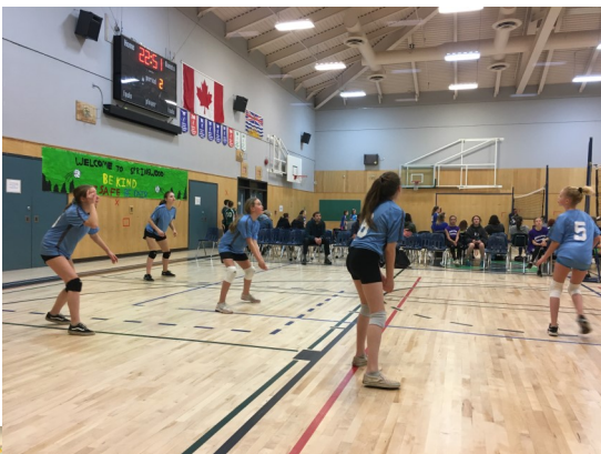
NBES girls volleyball team at SES for the district tournament.