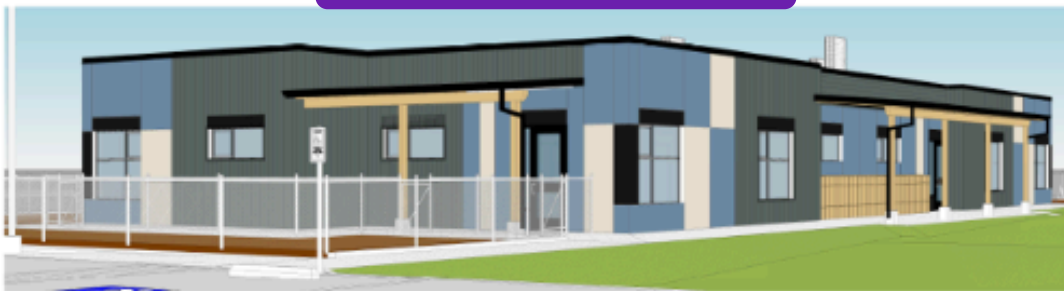
① 3D VIEW - SOUTH EAST CORNER