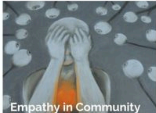
Empathy in Community

EARLY SUBMISSIONS BY FEBRUARY 14TH FOR A CHANCE TO BE FEATURED ON THE EXHIBIT POSTERS AND WIN EXTRA PRIZES