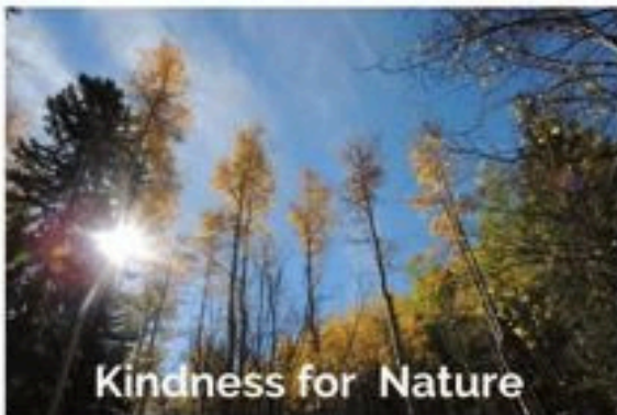
Kindness for Nature