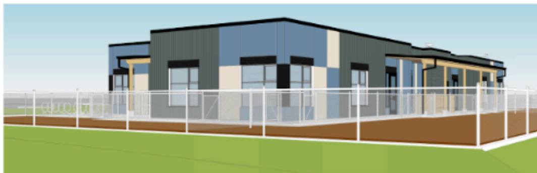
② 3D VIEW - NORTH WEST CORNER