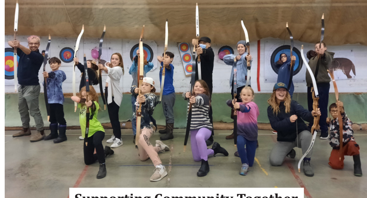
Supporting Community Together